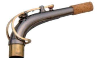
BLACK NICKEL PLATED